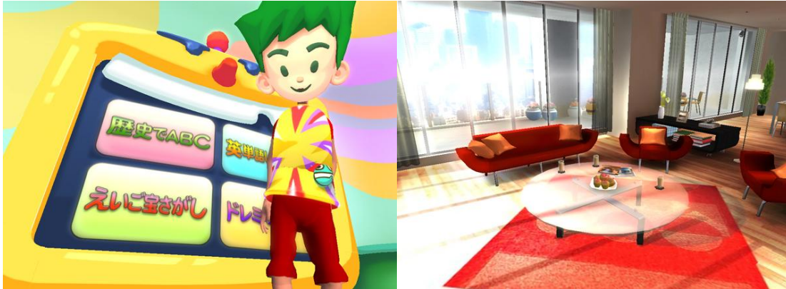
Educational services offered to children

We anticipate the range of applications offered to users to be extremely flexible and wide.